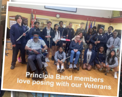
Principia Band members love posing with our Veterans